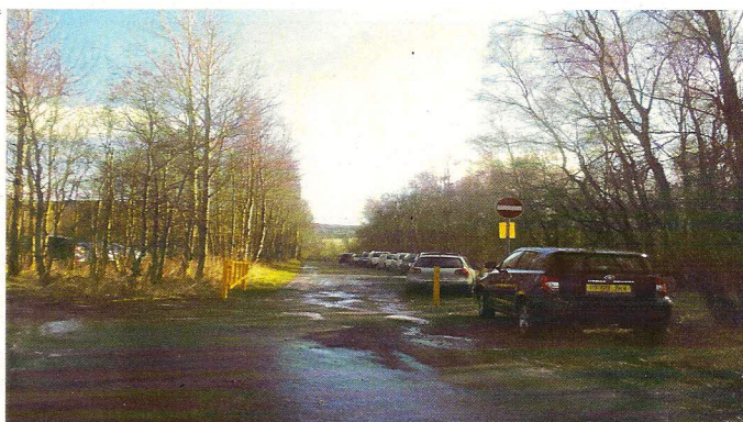
Parking outside the car park on a bright February Sunday